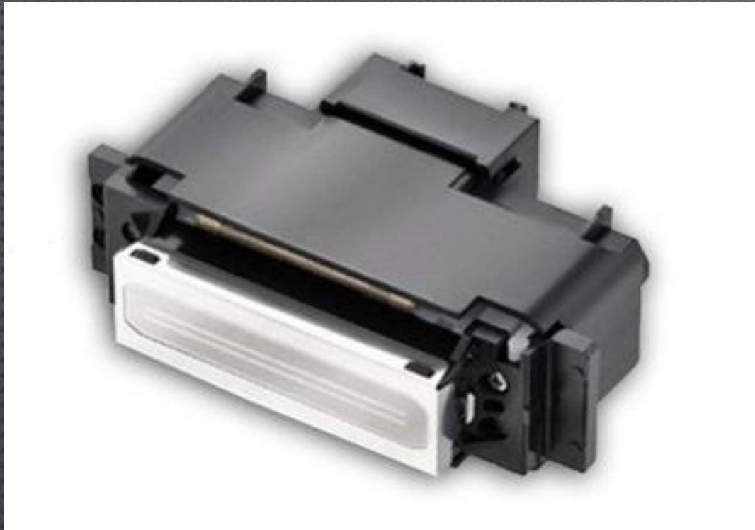
(4) RICOH GH 2220 Industrial Grade Print Heads

Designed to Thrive in the Most Demanding Print Shops